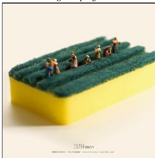
Image 1. Sponge farm