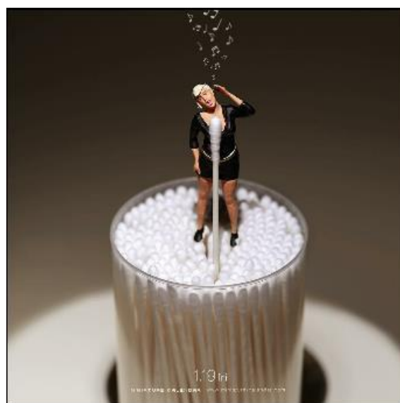
Image 5. Singer